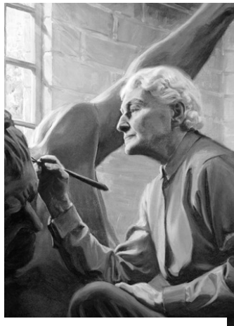
Anna Hyatt Huntington in 1958

The statue is bronze; the pedestal is made of granite and it supposedly contains stones from the dungeon in which Joan of Arc spent her final days. The pedestal bears two inscriptions: 1) Joan of Arc, born at Domremy France, January 6th, 1411; Burned at the Stake at Rouen, France, May 30th, 1431 and 2) Erected by the Joan of Arc Statue Committee in the City of New York, 1915.