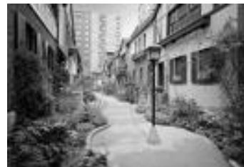
The interior layout of Pomander Walk

houses fronting on 94th and 95th street. Healy designed the Tudor-style residences with varying facades of brick, stucco and half-timbering. These carried over the scale but not the exact style of the original play's stage set.