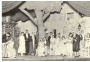
A 1928 theatre troupe in Pomander Walk at the Illinois Institute of Technology