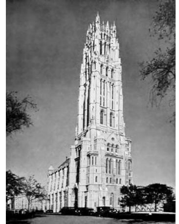
Riverside Church stretches out over two city blocks and is nearly 400 feet tall