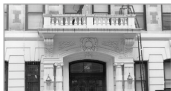
319 West 94 th street

Riverside Church has been “a stronghold of activism and political debate throughout its 75-year history. . .” – The New York Times